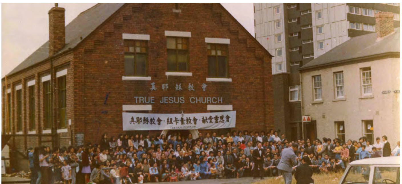
The dedication of True Jesus Church in Newcastle, UK in 1976.

In the UK, for example, the early believers who emigrated from the island of Ap Chau in Hong Kong underwent such a spiritual journey. In the 1960s, the first batch of Ap Chau youths arrived in the UK. They settled in areas far from the existing fellowship of